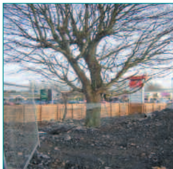
An example of an unprotected tree where ground levels have been altered.

Any remedial works that need to be carried out must be undertaken by qualified tree surgeons. Certain cultural operations may be required such as irrigation of the tree's root system. In certain situations the application of a phosphorus-based fertilizer can be applied in order to assist in the stimulation of new feeder roots. Where compaction has occurred it can be alleviated by the use of compressed air injection. Once any remedial works are complete and all plant equipment has evacuated the site, protective barriers and ground protection can be removed.