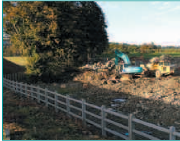
Construction site impacting on mature trees.

Protection of trees and site quality are key aspects for proposed development sites. To assure tree quality, all tree parts must be protected from acute and chronic damage. Tree preservation should be based on an informed evaluation and application of best-practice arboricultural principals integrated into the planning and design stage.