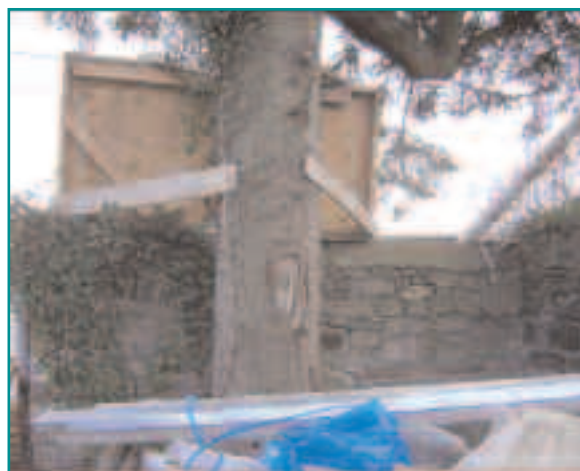
Tree displaying bark damage as a result of no protection. Possible entry point for pathogens.