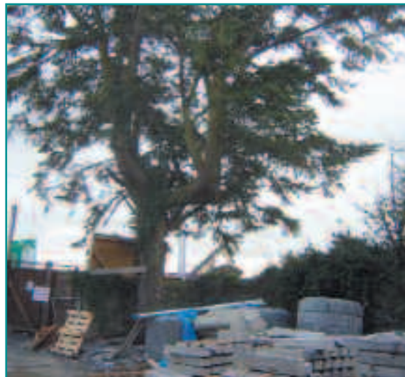
Unprotected tree. Note the storage of materials around the RPA. This tree will eventually succumb to the effect of soil compaction.