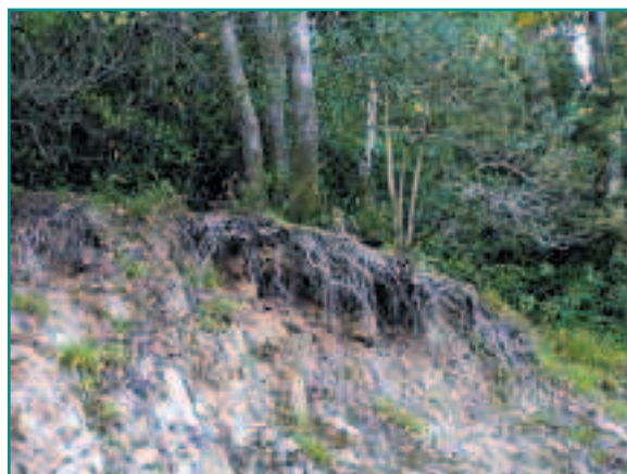
Oak with ground levels radically lowered exposing root system.

Increasing bulk density by one third can be expected to cost a tree one-half of its root and shoot growth.