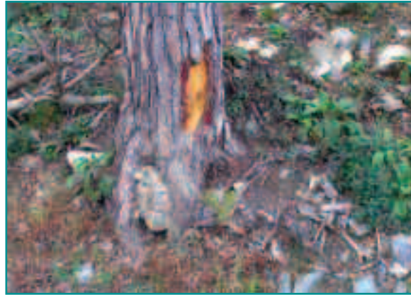
Scots pine showing damage to the trunk from construction works.

The bark of a tree forms a protective layer around the conducting tissues located immediately beneath.